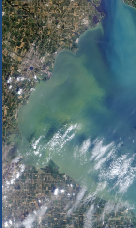
Harmful Algal Bloom near Toledo, Ohio, August, 2014.

U.S. Coast Guard Reauthorization Act (H.R. 1987): Co-sponsors include Rep. Duncan Hunter (CA-50). Provides for construction of a new icebreaker in the Great Lakes. PASSED by VOICE