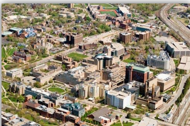
The plant's smoke stacks are visible near the bottom right corner, surrounded by MCCo members Case Western Reserve University and Case Medical Center; other MCCo members would appear to the left of this picture.

MCCo is a non-profit energy provider that uses DE to provide coal- and natural gas-fueled steam heat generation and chilled water to its nine member organizations, all of which are educational, community benefit, or religious non-profits in Cleveland's dense University Circle neighborhood. MCCo also purchases and distributes electricity through the local municipal utility. MCCo members report many benefits to being a part of the DE system, including cost-savings, improved reliability and efficiency, the ability to power specialized environments (e.g. the Botanical Garden), and a sense of community. In 2010, MCCo made the decision to phase out its aging coal-fired boilers and become coal-free. Among other efficiency-related investments, the company seeks to generate its own electricity by developing a natural gas- fueled CHP system.